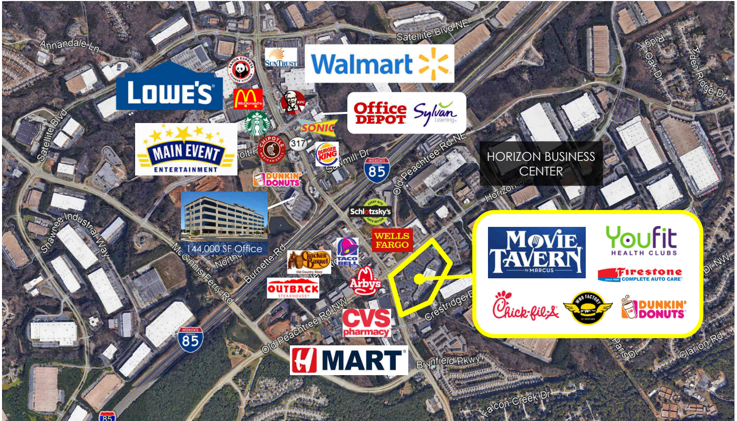
HORIZON DRIVE (18,100 VPD)